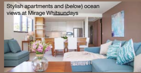
Stylish apartments and (below) ocean views at Mirage Whitsundays