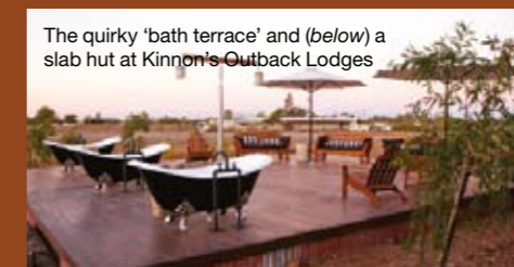
The quirky 'bath terrace' and (below) a slab hut at Kinnon's Outback Lodges