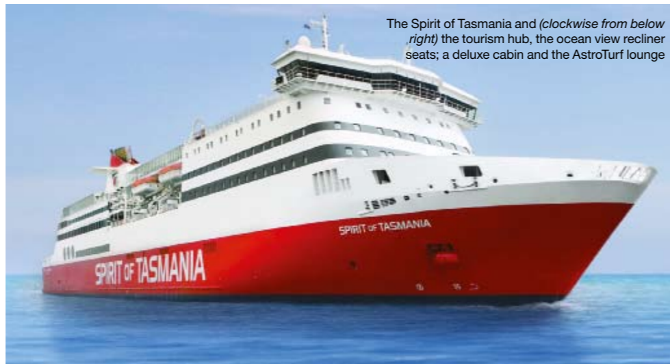
The Spirit of Tasmania and (clockwise from below right) the tourism hub, the ocean view recliner seats; a deluxe cabin and the AstroTurf lounge